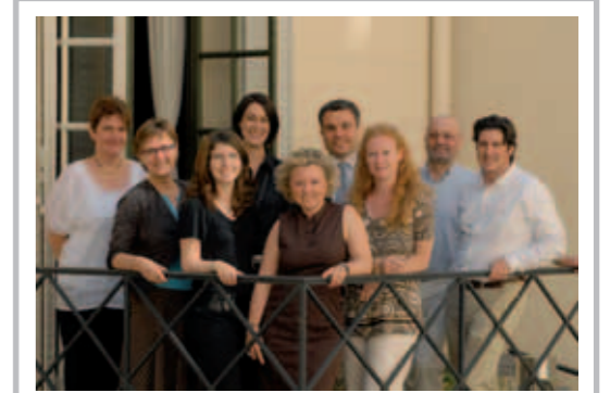
2009 Jury's members

Among the winners of the Grand Prix du Jouet, the most innovative receives the title of "Jouet de l'année 2010".