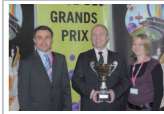
The winners of the Grands Prix for the Distribution of Games and Toys in 2008